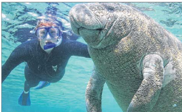
The Plantation on Crystal River, a golf resort on Florida's west coast, offers snorkeling tours that allow guests to interact with the endangered West Indian manatee.

For Type A vacationers who find it impossible to simply relax in a tranquil spot waiting for a bite, there's a more exciting option — nocturnal shark fishing. Adventur-