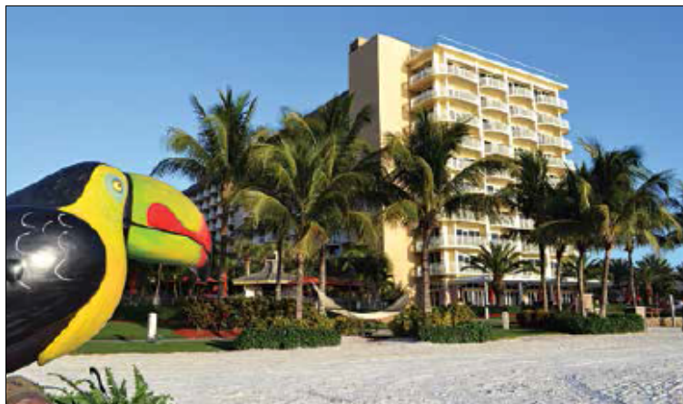
The Marco Island Marriott Beach Resort.