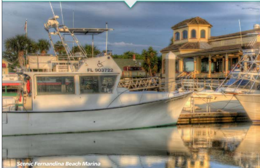
Scenic Fernandina Beach Marina

are purchased from the driver. After the tour, be sure to stop by the Palace Saloon, Florida's longest-operating saloon and reportedly designed by Adolphus Busch of Anheuser-Busch fame, for a cool one!