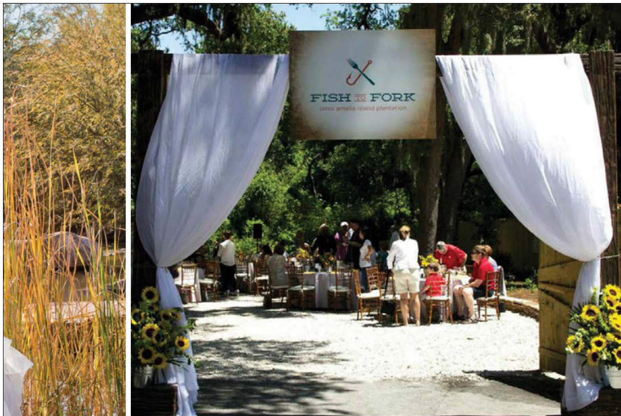
Top, left: Weddings at Sheraton Grand at Wild Horse Pass in Arizona tie in the surroundings. Top, right: Event at The Sprouting Project at Omni Amelia Island Plantation Resort.

property, which has an onsite event planner who assists with wedding coordination, is constructing a new Event Tent and a new Royal Tent Suite .