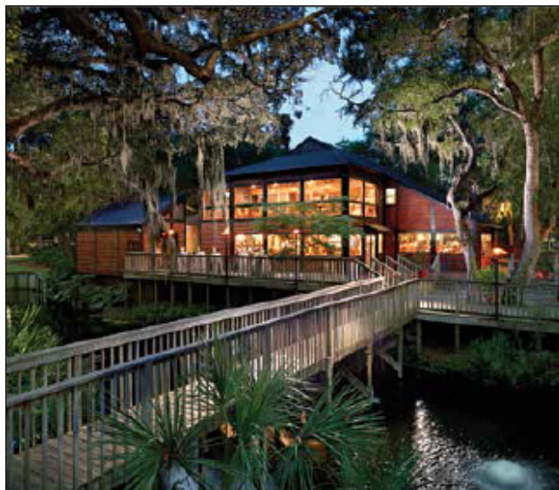
The Falcon's Nest restaurant and pub at Omni Amelia Island Plantation Resort boasts the best burgers in town.

chorus of accolades. Florida Encounter has built a reputation as one of the premier hosted buyer programs in the meeting industry. As a result, it selects each year's destination and hotel with great care. And for 2015, Omni Amelia Island did an outstanding job for attendees, including a representative from Corporate & Incentive Travel as a media member. Florida Encounter will partner with Experience Kissimmee and Omni Orlando Resort at ChampionsGate next year. The event is set for November 29–December 2, at the Omni property.