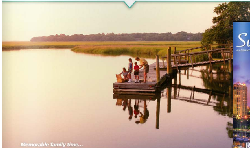
Memorable family time...