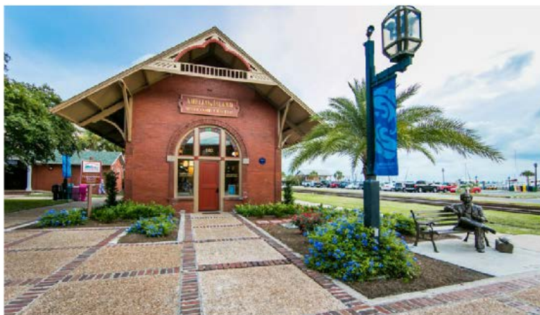
The Amelia Island Welcome Center is located in the historic train depot

Fort Clinch State Park boasts a fishing pier and a wide variety of family-friendly recreational activities including swimming, fishing, sunbathing, hiking, biking and wildlife viewing.