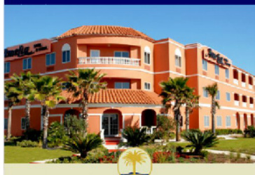
AMELIA HOTEL AT THE BEACH

LIKE US ON FACEBOOK FOR SEASONAL SPECIALS