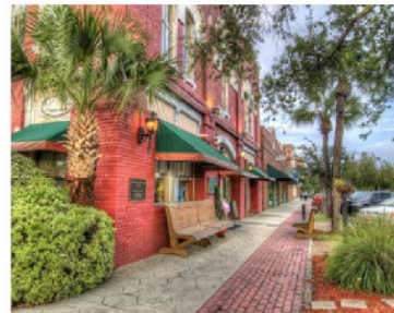
Explore unique shops and galleries