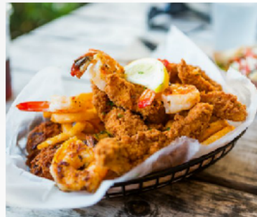
A delectable shrimp basket!

Time for fun in the sun? Prepare for natural Appalachian quartz beaches framed by sand dunes, some as high as 40 feet! Amelia Island is home to five main stunning beaches each with its own amazing appeal. Main Beach Park is Amelia Island's most well known beachfront park and a family favorite with a playground,