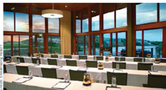
Natural light streams into a meeting room with extraordinary views of the golf course at Streamsong Resort in Central Florida.

Among Floridians in the know and well-informed meeting planners, Amelia Island and Fernandina Beach rank high on "favorite place to go" lists. Last year, Visit Florida, the Official Florida Tourism Industry Marketing Corporation, held its annual Florida Encounter, a hosted buyer show for meeting planners from across the country, at Omni Amelia Island Plantation Resort. The hotel and the destination earned a