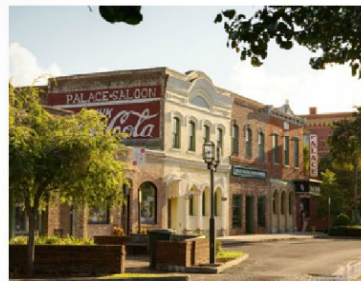
Amelia Island is a timeless destination

walked before you and learn about 4,000 years of history. For example, the Victorian courthouse, built in 1891 and located in the heart of town on Centre Street, is the oldest county courthouse in Florida that is still in use today. Hop on the Amelia Island Trolley for a one hour and 15 minute tour of downtown Fernandina, Old Town and the silk stocking district. Located at the end of Centre Street at the marina, tickets for this journey back in time