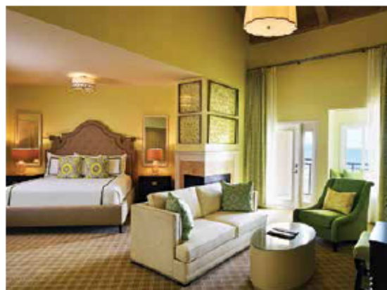
A newly refreshed deluxe ocean suite at Ponte Vedra Lodge & Club in northeast Florida near Jacksonville.

Nearby offsite attractions include the charming Village of Baytowne Wharf, Topsail Hill Preserve State Park, Big Kahuna's Water and Adventure Park, Gulfarium Marine Adventure Park and the Silver Sands Premium Outlet shopping center.