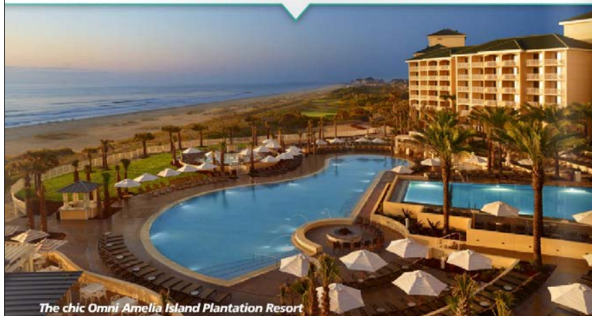
The chic Omni Amelia Island Plantation Resort

The upscale, oceanfront Omni Amelia Island Plantation Resort is a vacation destination in itself. Nestled on 1,350 spacious acres with a 3.5-mile private beach and offering over 400 oceanfront guest rooms and suites with patios and balconies, guests can relax in oceanfront luxury. Featuring an infinity edge adult swimming pool, a 10,000-square-foot family friendly pool, a children's splash park and two hot tubs, guests can lounge poolside on the largest multi-tiered pool deck in northeast Florida. Spend an afternoon kayaking and